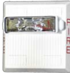
SERIES MT STROBE